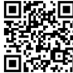
( QRCode code used to Check in, Check out )

Step 6: Save the QR code to confirm the health declaration and present at the airport (if required).